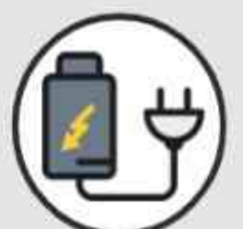
Inbuilt battery charger