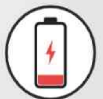
Low Battery Indication