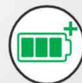
Double batteries operated